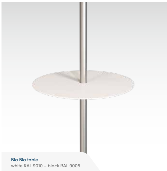
Bla Bla table white RAL 9010 – black RAL 9005