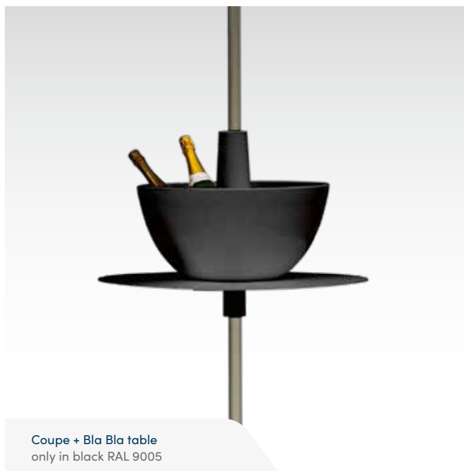
Coupe + Bla Bla table only in black RAL 9005