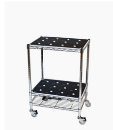
Small Recharging Station 24 Lamps