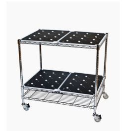
Large Recharging Station 48 Lamps