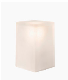
Sand Blasted Pressed Glass Ice Square 100