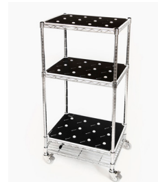
Medium Recharging Station 36 Lamps