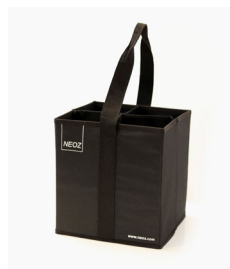
Handling Accessory 4 Lamp Carrier (Optional)

NEOZ The darling of dining tables www.neoz.com