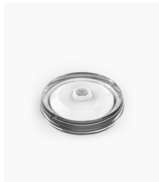
Single Lamp Charger 1 Lamp