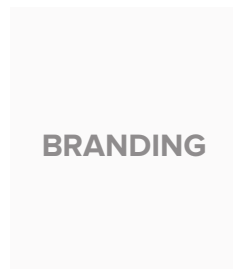
Commercial Customisation Logos