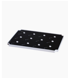
Large Recharging Tray 12 Lamps