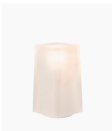
Sand Blasted Pressed Glass Ice Square 85