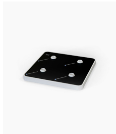
Small Recharging Tray 4 Lamps